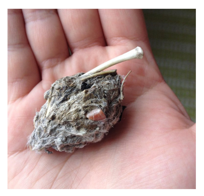
Fig. 3. A regurgitated pellet collected from a great skua (Stercorarius skua).

interest (Ryan and Fraser 1988; Votier et al. 2001; Hammer et al. 2016). In contrast to the accumulated plastics found during stomach dissections, pellets, like regurgitations, represent a snapshot of only a short period of time. Most pellet collections are also limited to the breeding season when marine birds are at terrestrial nesting sites, limiting seasonal comparisons in many species.