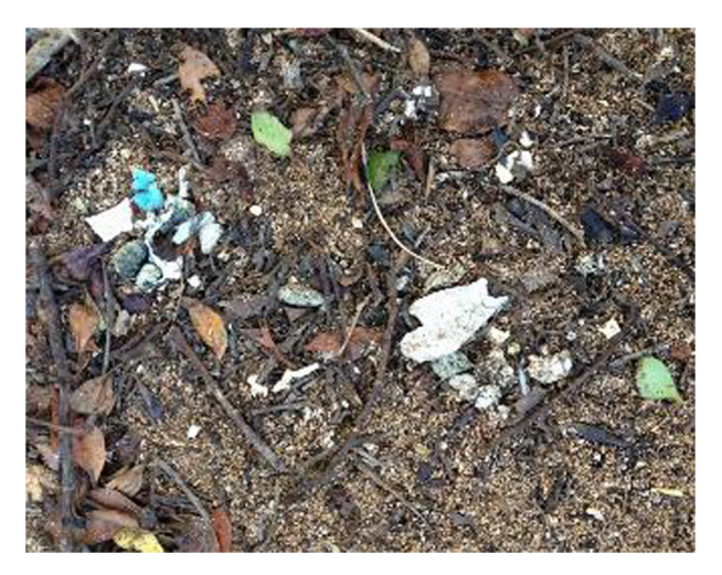
Fig. 4. Example of a sprayed regurgitation from a flesh-footed shearwater ( Ardenna carneipes ) from Lord Howe Island. These pellets are not intact, and thus of limited use to assess small microplastics that are easily lost to the environment.