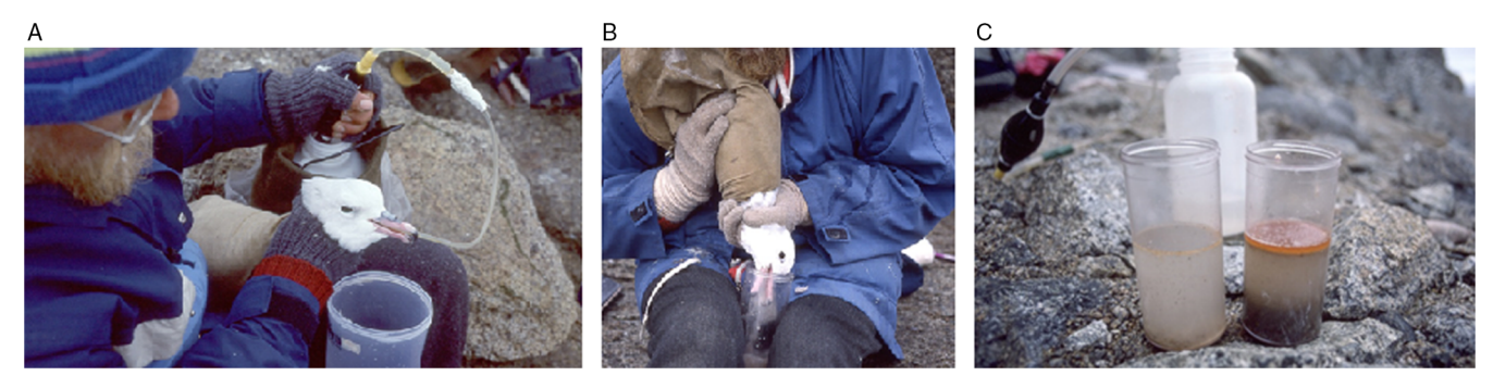
Fig. 1. A southern fulmar (Fulmarus glacialoides) being lavaged in the field. (A) using a simple hand pump, hand-warm water is pumped into the stomach of the bird until fully filled; (B) the bird is then held over a sample container to collect the regurgitation, this is done at least twice to check for completeness of the sample; and (C) the regurgitate is then collected for examination back in the laboratory (right first flush, left second flush).