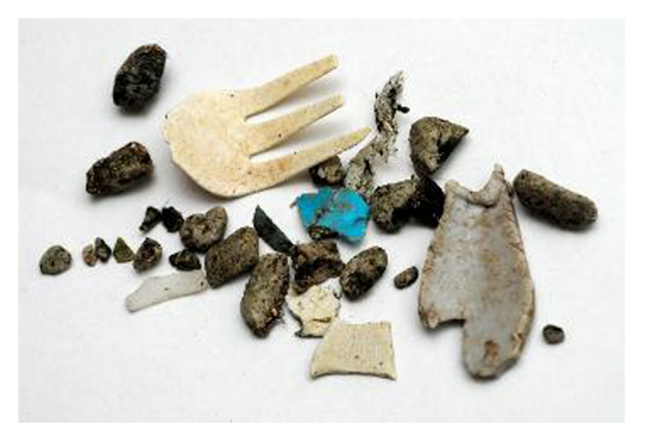
Fig. 5. Plastic items and pumice found in a pellet from a flesh-footed shearwater ( Ardenna carneipes ) from Lord Howe Island.

being lost to the environment or inflated because of additional plastic pieces from the environment. The GIT may be preserved (e.g., freezing or submersion in ethanol) so that it can be processed under controlled laboratory conditions at a later date.